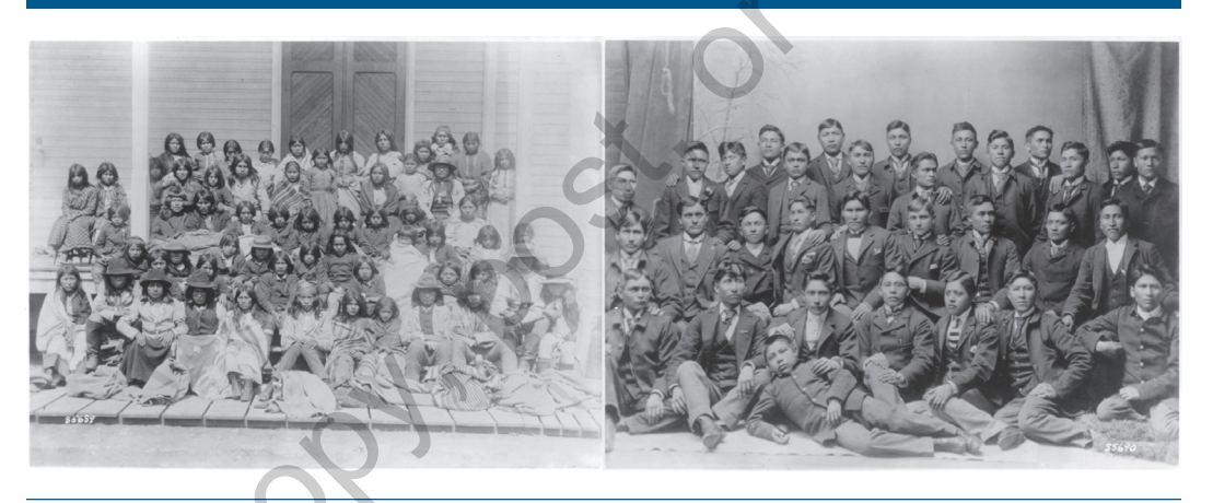
FIGURE 1.1 Apache Children Before and After Entering Off-Reservation Boarding School